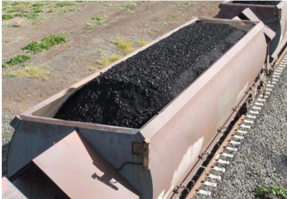
Figure 2 - Top of loaded coal wagon showing 'Garden Bed' style profile.