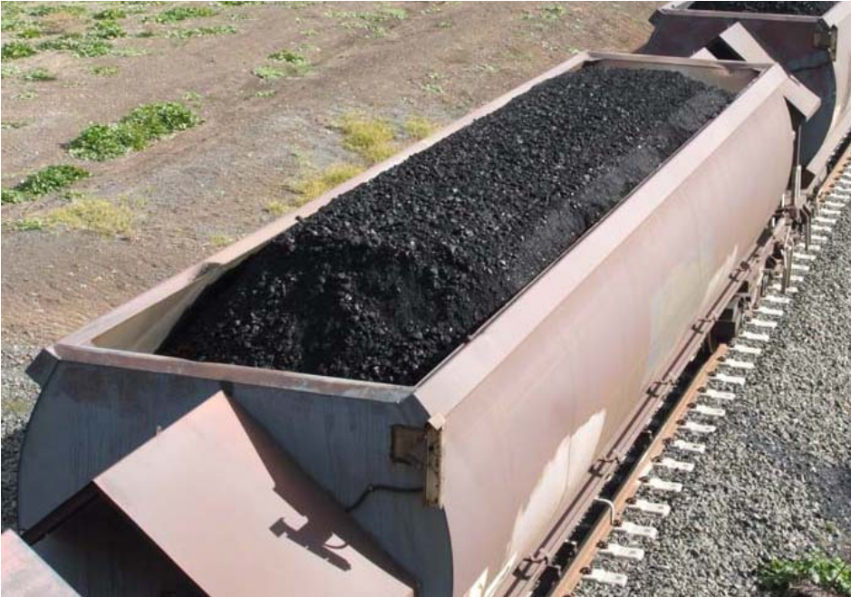
Figure 2 - Top of loaded coal wagon showing 'Garden Bed' style profile.