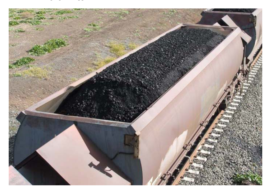
Figure 2 - Top of loaded coal wagon showing 'Garden Bed' style profile.

(c) A suitable profiler must be used to profile the coal so as to result in a loaded wagon with a coal profile that optimises the effectiveness of veneering agents applied in order to Prevent Coal Loss. Without limiting the type of profile that the Owner may adopt, an appropriately designed and maintained telescopic loading chute can achieve a 'garden-bed' profile (standard loading profile as shown in Figure 2 below.) to mitigate the risk of coal lift-off and to optimise the effectiveness of veneering agents applied in order to Prevent Coal Loss.