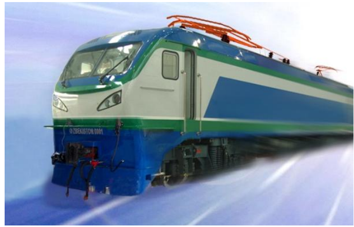
Electric Locomotive for Uzbekistan

Manufacturing in one country and exporting to another is a typical operating mode for locomotives business.