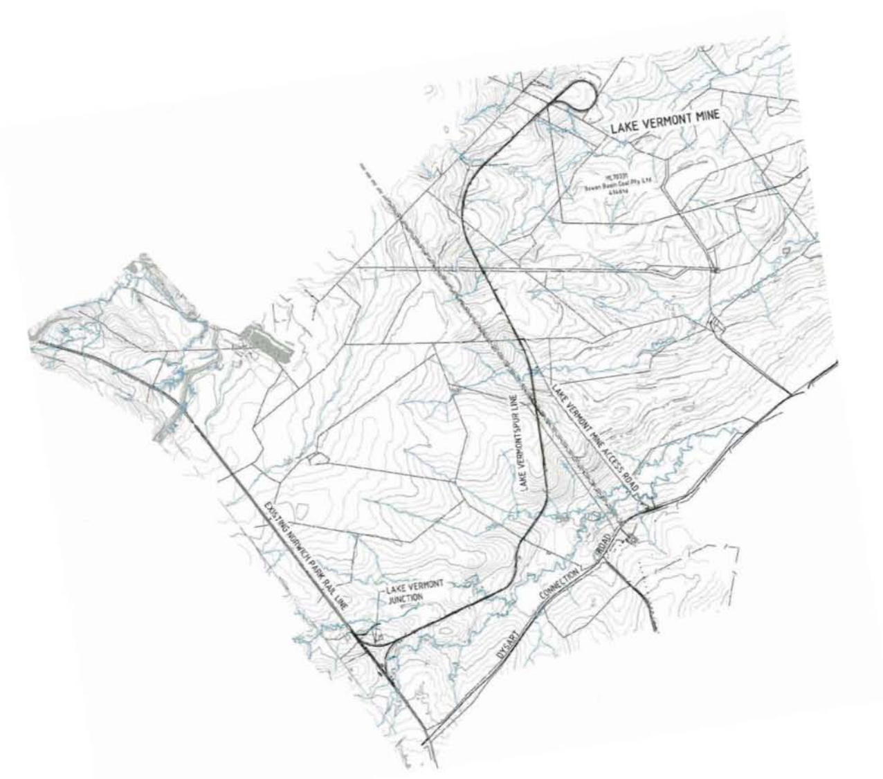
Figure 1. Lake Vermont Spur and Balloon Loop

For the purposes of deriving a tariff for UT2, Lake Vermont will only be travelling south. The spur and balloon loop connects to the existing South Goonyella mainline (labelled as Norwich Park rail line) as shown in Figure 1.