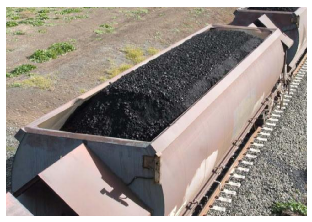
Figure 2 - Top of loaded coal wagon showing 'Garden Bed' style profile.